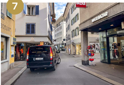
7 The 1st street on the right leads you directly...