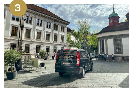
3 Cross the square completely