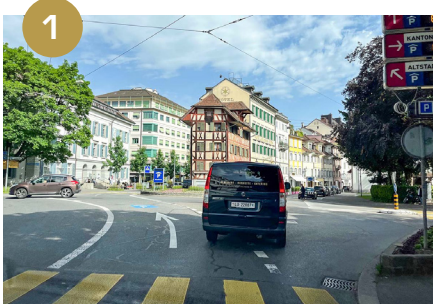
1 Turn right into the street in front of the Kesselturm multi-storey car park