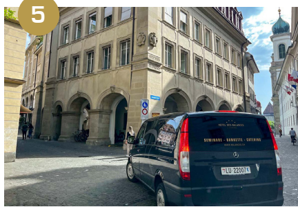
5 First street turn left into the pedestrian zone