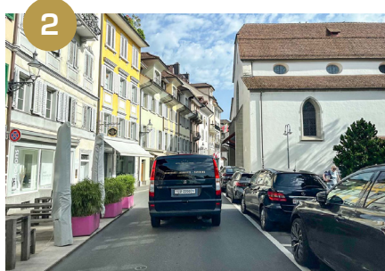
2 Continue straight ahead until you reach Franziskanerplatz