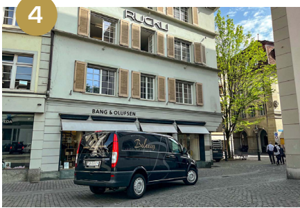
4 Then turn right into the small street