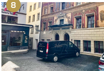
8 ...in front of the Hotel des Balances at «Weinmarkt»