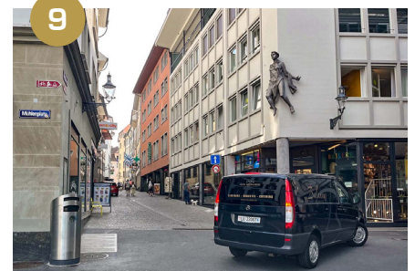
9 Turn right into the small street