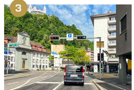
3 Turn right at the traffic lights