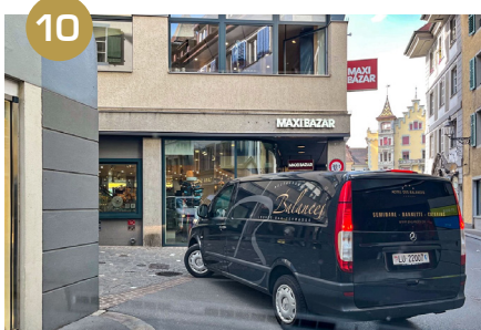
10 The 2nd street on the left leads you directly...