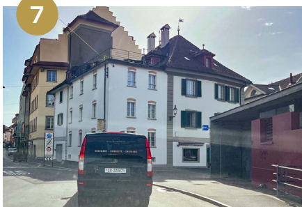
7 After the wooden bridge turn right