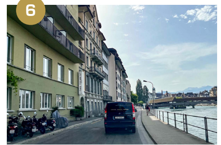
6 Straight ahead on St. Karlistrasse to the wooden bridge