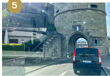
5 After the bridge, turn right (through the narrow tower)