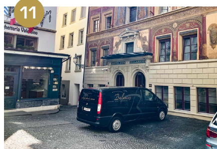
11 ... in front of the Hotel des Balances at «Weinmarkt»