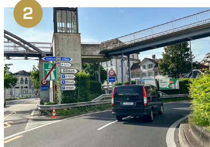
2 Take the right lane with the arrow/note GÜTSCH