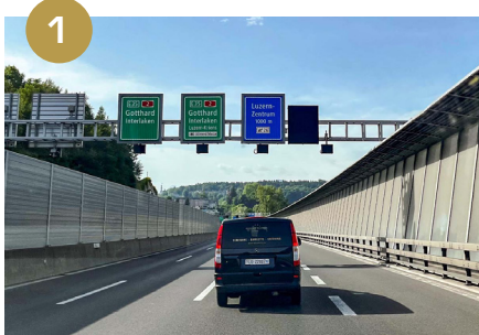
1 Take the exit LUZERN ZENTRUM