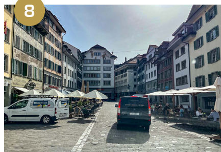
8 Cross the square completely